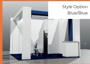
Style Option Blue/Blue