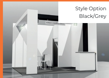
Style Option Black/Grey