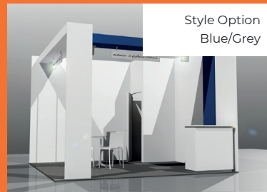
Style Option Blue/Grey