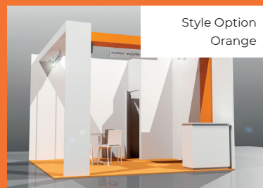
Style Option Orange