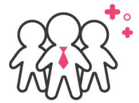
Business Matching Hosted Buyer